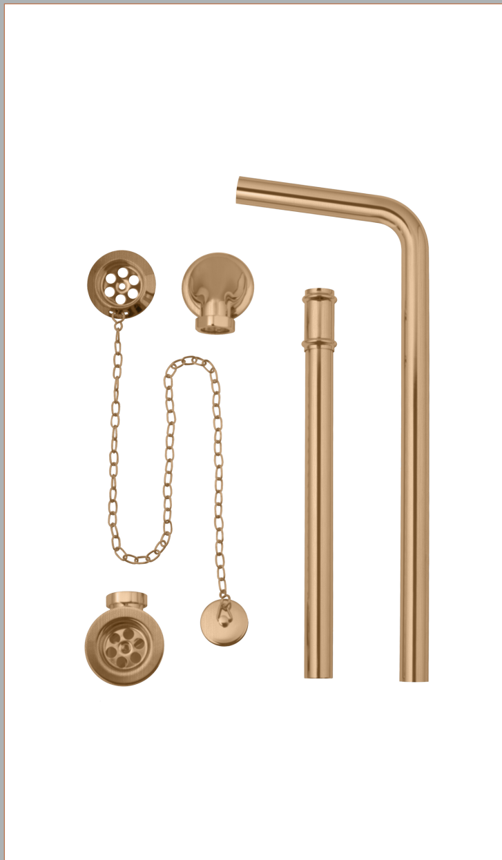
WAS030 Exposed Bath Waste & Overflow, Stowaway Plug.

Description: Plug & Chain Exposed Ext Bath Waste